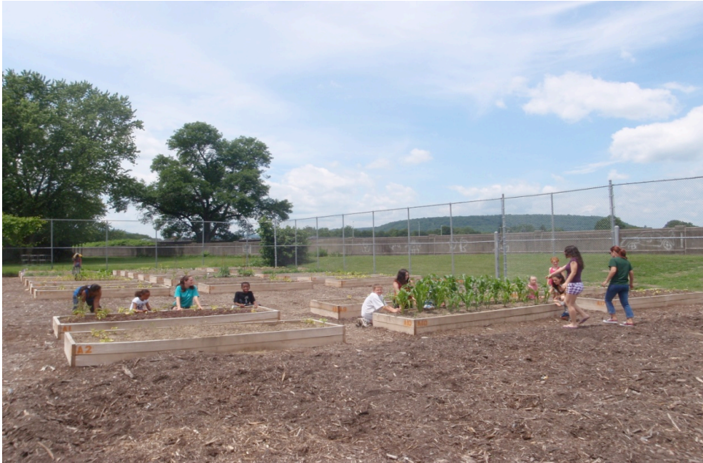
Gardeners tend to the vegetables in raised beds in an old tennis court.

We partnered with the city of Elmira to convert an unused and deteriorating tennis court in an Elmira city park into a free community garden with 48 raised gardening beds. The city of Elmira removed the tennis courts and installed a mulch base, water line and tool shed. The Chemung County Soil & Water Conservation District provided free wood for the beds and local carpenters volunteered to build the beds for free. The town of Chemung donated topsoil. Volunteers from The Park Church in Elmira manage the garden. Some of the produce was donated to a local food pantry.