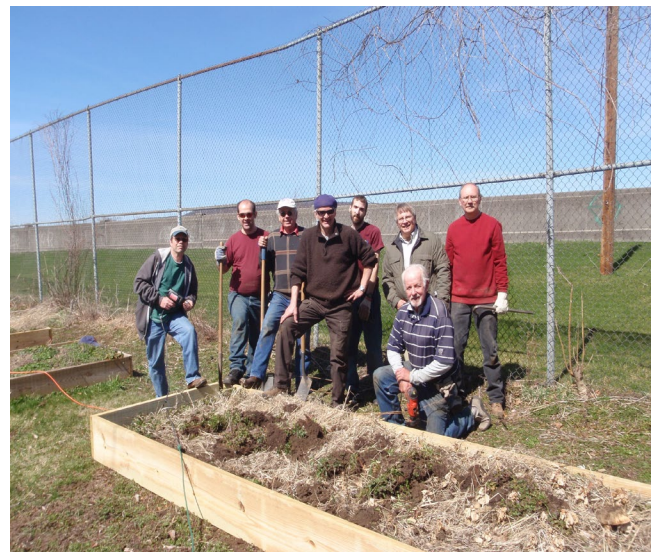
Above photos: Staff and job trainees from The Arc of Chemung help repair and build garden beds.