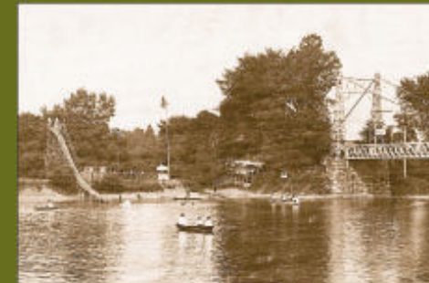
Shoreline view of Fitch's Bridge and the famous early 20th-century water toboggan, ca. 1900.

While the river provided recreation, it could also prove deadly. Fitch's Bridge was named after Ezra Fitch who