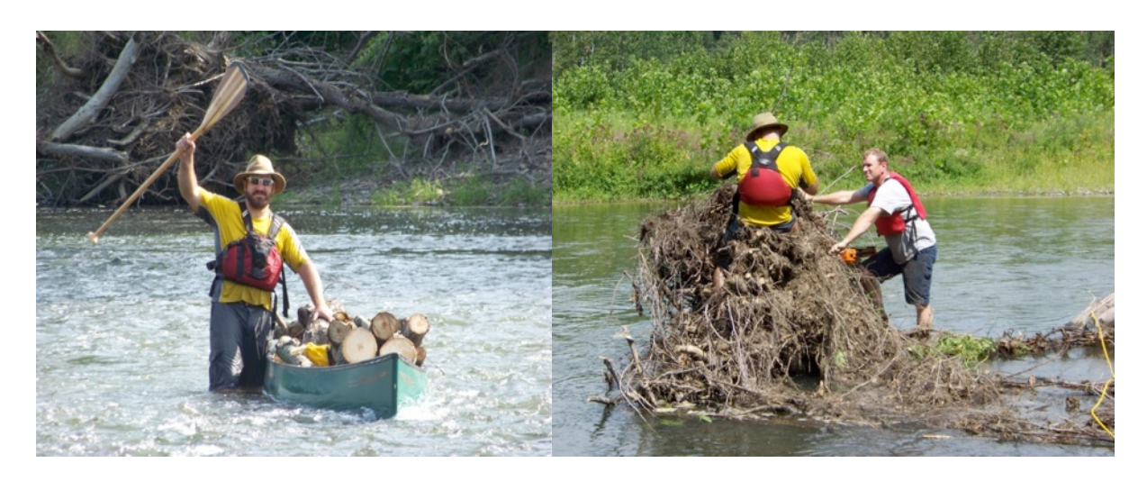
Volunteers remove trees and stumps from the Chemung River in Big Flats

This year saw more organizations adopt boat launches to help keep the launches clean and safe and monitor the sites for needed repairs or problems. The Big Flats Business Association adopted the Bottcher's Landing launch in Big Flats. Employees from Cameron Manufacturing & Design in Horseheads adopted the Fitch's Bridge Boat Launch in Big Flats. This hands-on citizen involvement is important in protecting our waterways. It gives people ownership and pride and encourages them to care for and respect our rivers and streams.