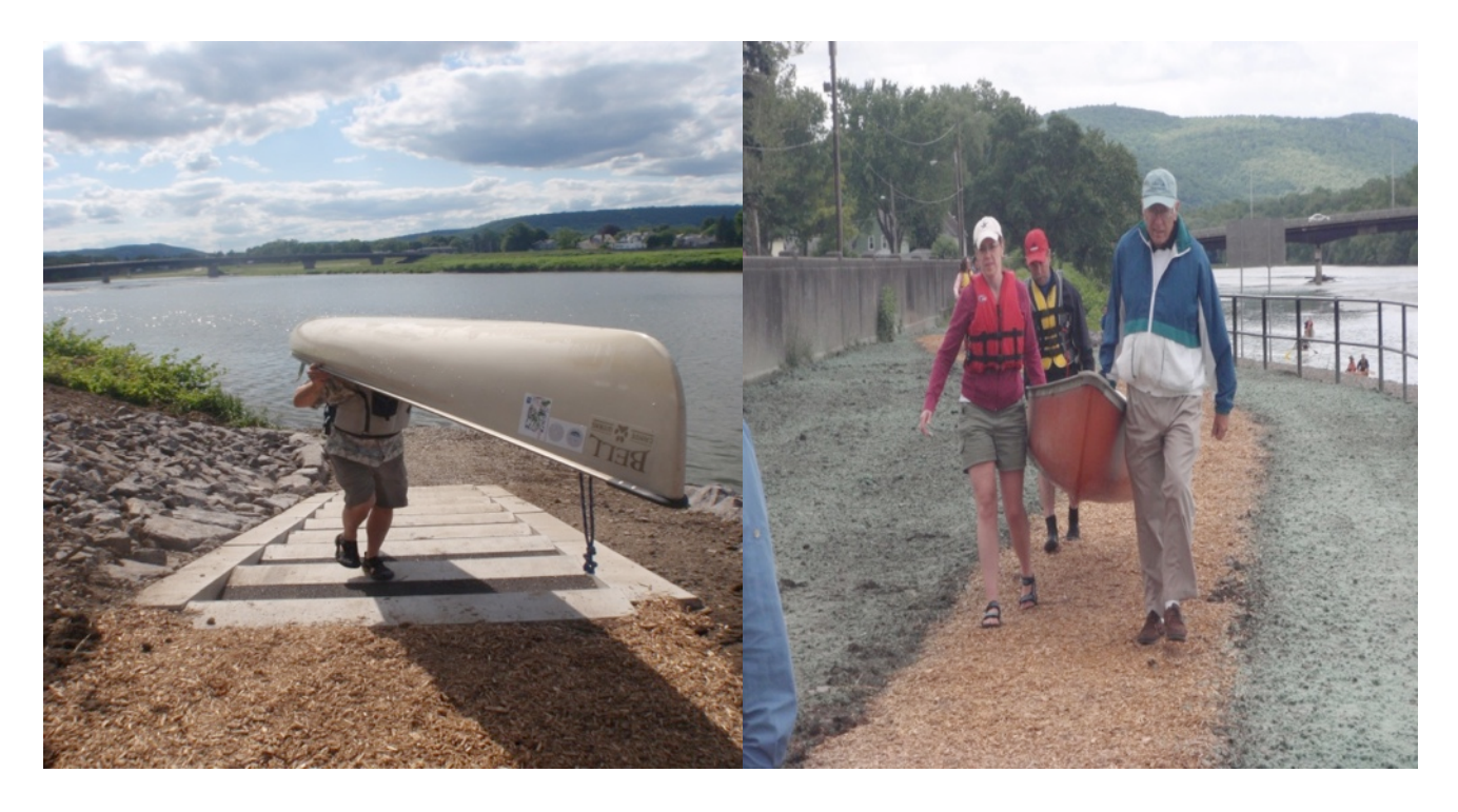
Paddlers carry canoes up the portage stairs and along the trail at the Don Hall Portage in Elmira

River Friends and the city of Elmira built a safe passage for paddlers around the Chase-Hibbard Dam in downtown Elmira. The Don Hall Portage opened in June and features a 730-foot river shore trail. The portage allows boaters to paddle the entire 45 miles of the river.