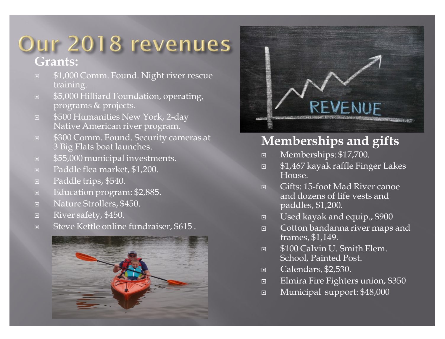
2018 Financial report

We continue to seek and gather feedback from river and trail users through conversations, public presentations and programs and through social media.