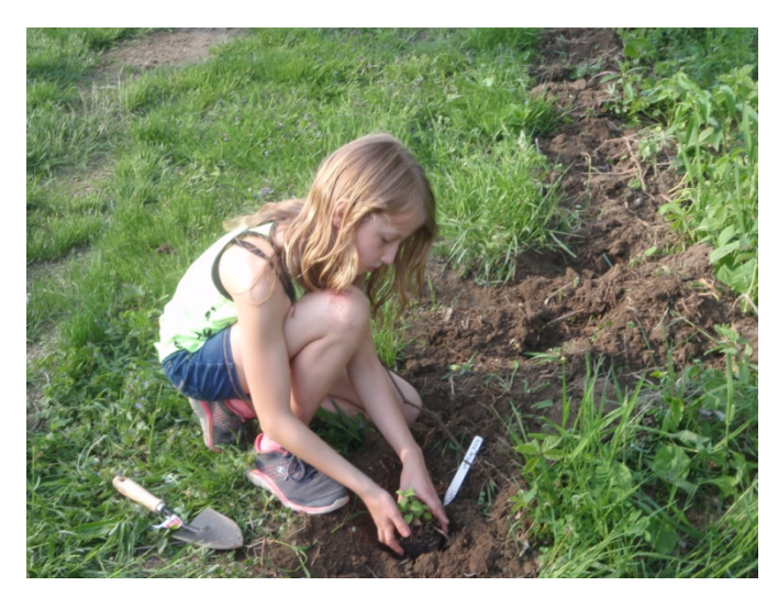
Big Flats Elementary student planting flowers at Bottcher's Landing

We installed three game cameras at boat launches where we have trouble with dumping and other issues to help law enforcement arrest people who abuse and use the boat launches for illegal activities.